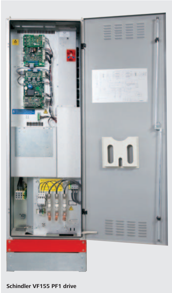
Schindler VF155 PF1 drive

Regenerative drives return energy back to your building's power grid to be used for other power needs in your building. Essentially it's like spinning your electric meter backwards. Schindler can provide regenerative drive technology to substantially improve the energy efficiency of your elevator system, whether your building has geared or gearless traction equipment.