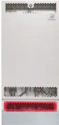
Schindler VF88 PF1

Schindler's PF1 compact, energy-efficient drive is available for AC geared and gearless configurations.